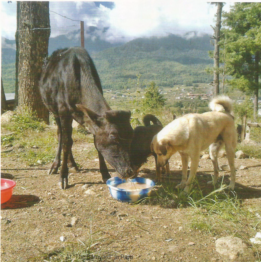
At "The Barnyard" in Paro