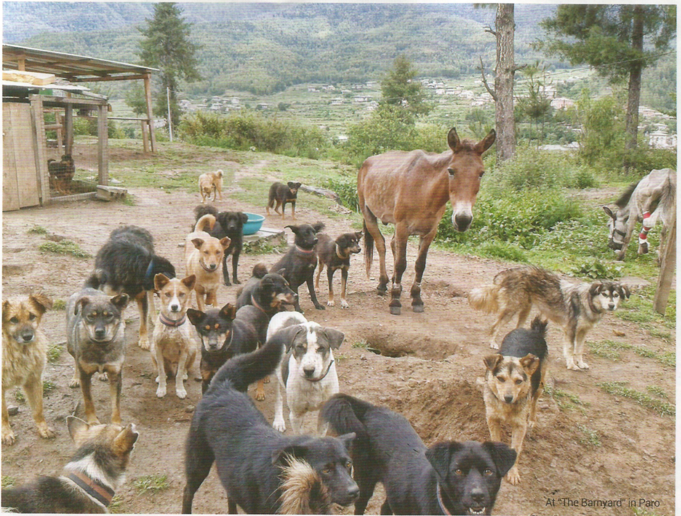
At "The Barnyard" in Paro