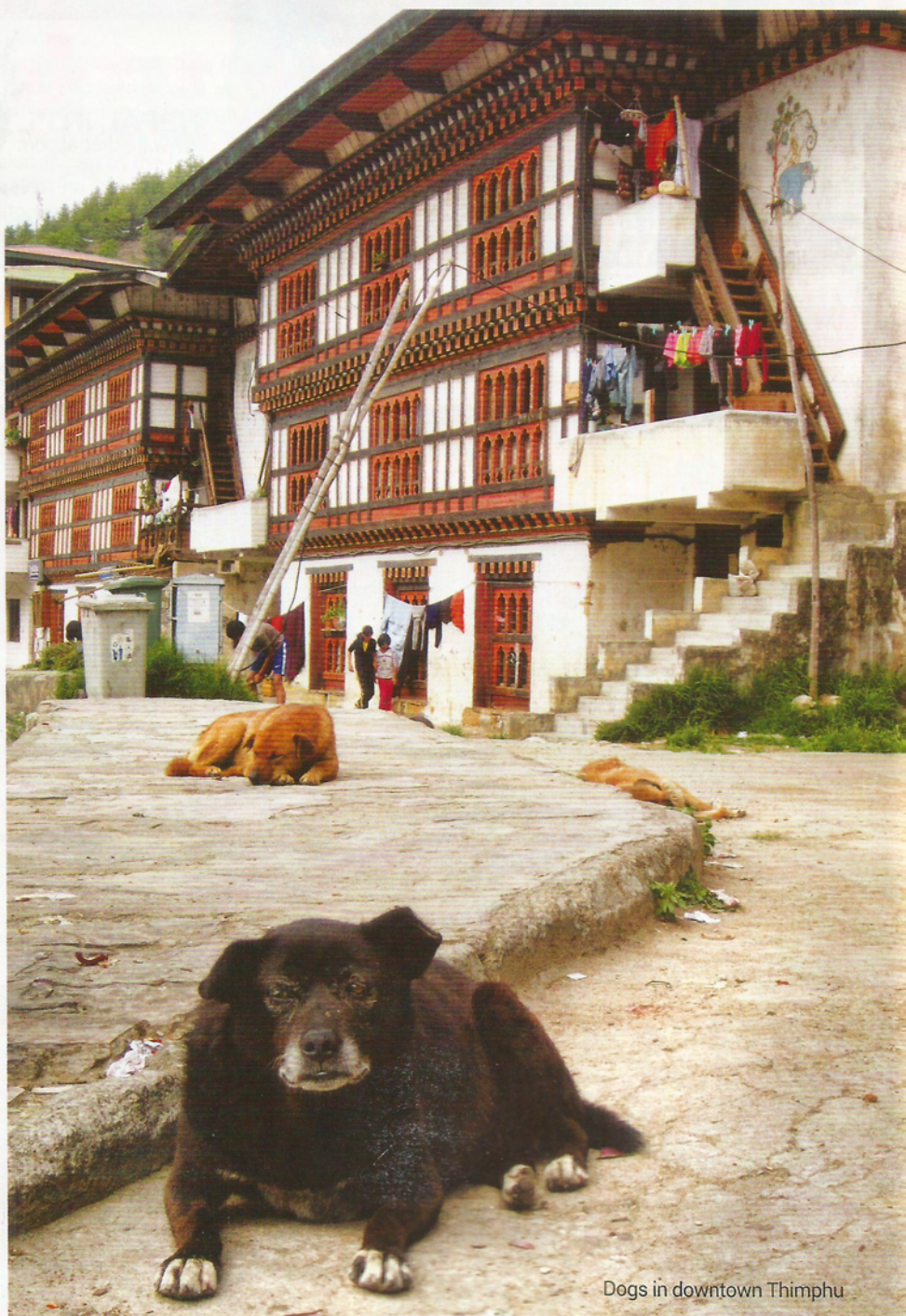
Dogs in downtown Thimphu

In broad daylight and enjoying the warm afternoon sun, I could see the culprits, sleeping, resting in the